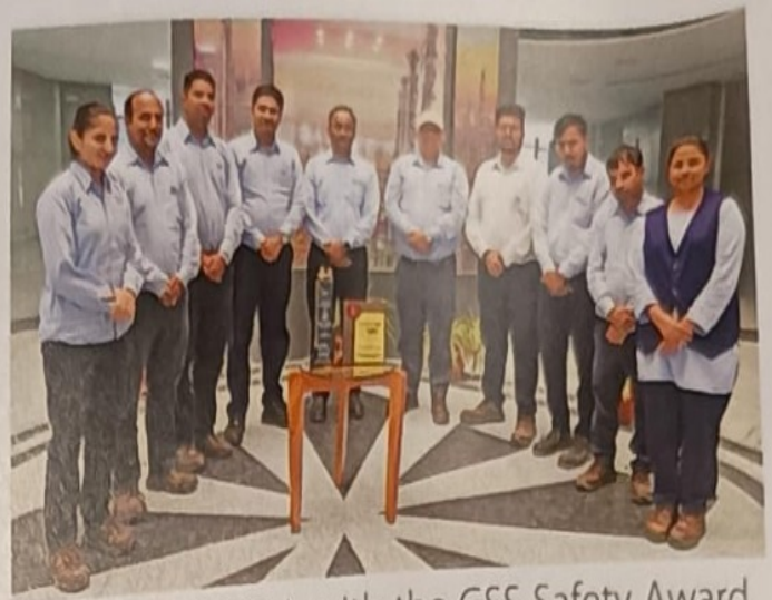
Team HSE of OPaL with the GSS Safety Award.

O NGC Petro additions Limited (OPaL) has been honoured with the Global Safety Summit (GSS) Safety Award 2024 in the Large Enterprises category. This prestigious recognition was conferred by the World Safety Forum and the United Nations Global Compact Network at the 12 th Global Safety Summit held in New Delhi on 23 rd December, 2024. The GSS Award is considered as one of the