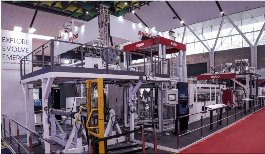
Lamina rPET - Sheet Extrusion line displayed at Plastfocus-2024

In line with its dedication to sustainability, Rajoo unveiled its rPET sheet extrusion line, that transforms PET bottle flakes into high-quality sheets, effectively closing the loop in plastic production processes. With outputs reaching up to 1400kg/hr, this initiative underscores Rajoo's commitment to leading the charge in promoting recycled plastics and sustainable practices.