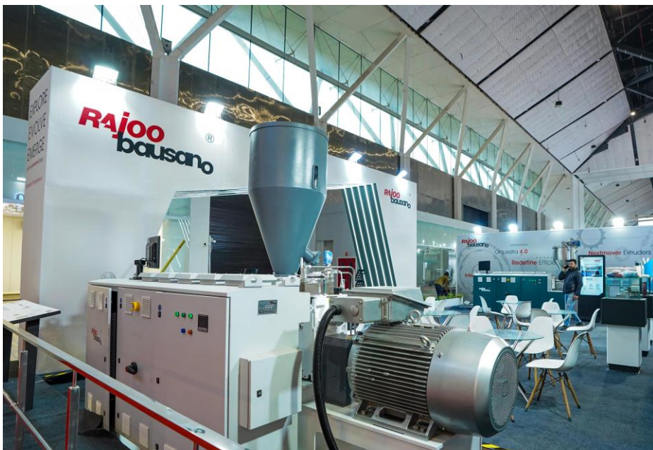
Technology for CPVC Compounding displayed at Plastfocus-2024

In line with its dedication to sustainability, Rajoo unveiled its rPET sheet extrusion line, that transforms PET bottle flakes into high-quality sheets, effectively closing the loop in plastic production processes. With outputs reaching up to 1400kg/hr, this initiative underscores Rajoo's commitment to leading the charge in promoting recycled plastics and sustainable practices.