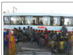
Rajoo Family Distributing Milk Underprivileged People