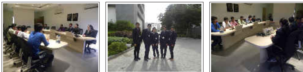
Industrial visit by Atmiya College Students

Every year, more than 50 students get an opportunity to join our internship programme, which enables them to gain practical knowledge of what they have learned and get invaluable on-the-job experience. This encourages them to explore the career choices that lie ahead of them.