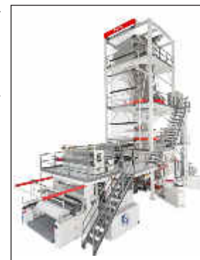
Pentafoil - Five layer

Rajoo's Pentafoil - Five layer All-PE blown film line indigenously designed and built, with latest advancements in technology is truly eco-friendly in a dual way – one from the environmental perspective (by getting more out of less by down gauging and lower energy consumption) and the other from the economics perspective (better performance with cheaper raw materials). Operating at 600.4 kg/hour, TUV certified during an on-site visit, that the specific electricity consumption under standard conditions for the 5 layer co-extruded blown film line PENTAFOIL-APERECF- 260-90/2400 IBC-Awas 0.3001 KW/kg of blown film (producing 40 micron thickness, 2000 mm width)