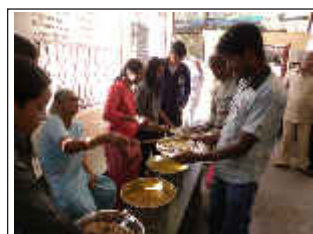
Rajoo Family Distributing Food At Civil Hospital Rajkot