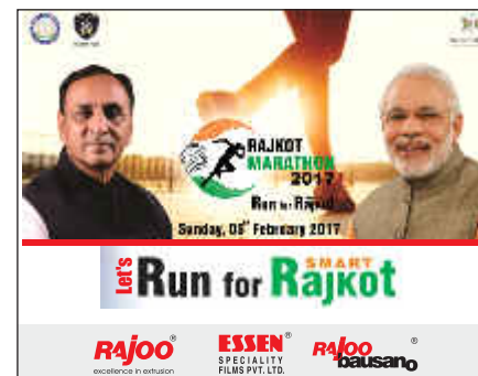
Rajkot Marathon - 2017 Sponsored by the Rajoo Group

Thousands of citizens participated in the grand event. The marathon aimed to create awareness about cleanliness and traffic among citizens in Rajkot. The event was sponsored by the Rajoo Group. The company played the role of a catalyst to elicit positive change in the society. The attempt was to motivate people to act out of their own convictions, and support the efforts in building a smart City.