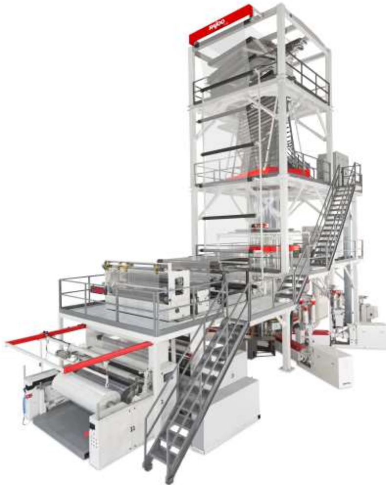
Rajoo's Pentafoil – Five Layer Co-extruded Blown Film Line for POD-Overview

For us, every sale is a project; the one at Constantia India, however, is even more special as it reinforces the stamp of 'excellence in extrusion' for Rajoo, an initiative at Rajoo that is getting stronger by the year. To add, the Rajoo 5-Layer POD Blown Film Line is today running successfully in over 15 countries. To Rajoo, this project is extremely special as it comes after the customer has experienced globally acclaimed technologies for years now.