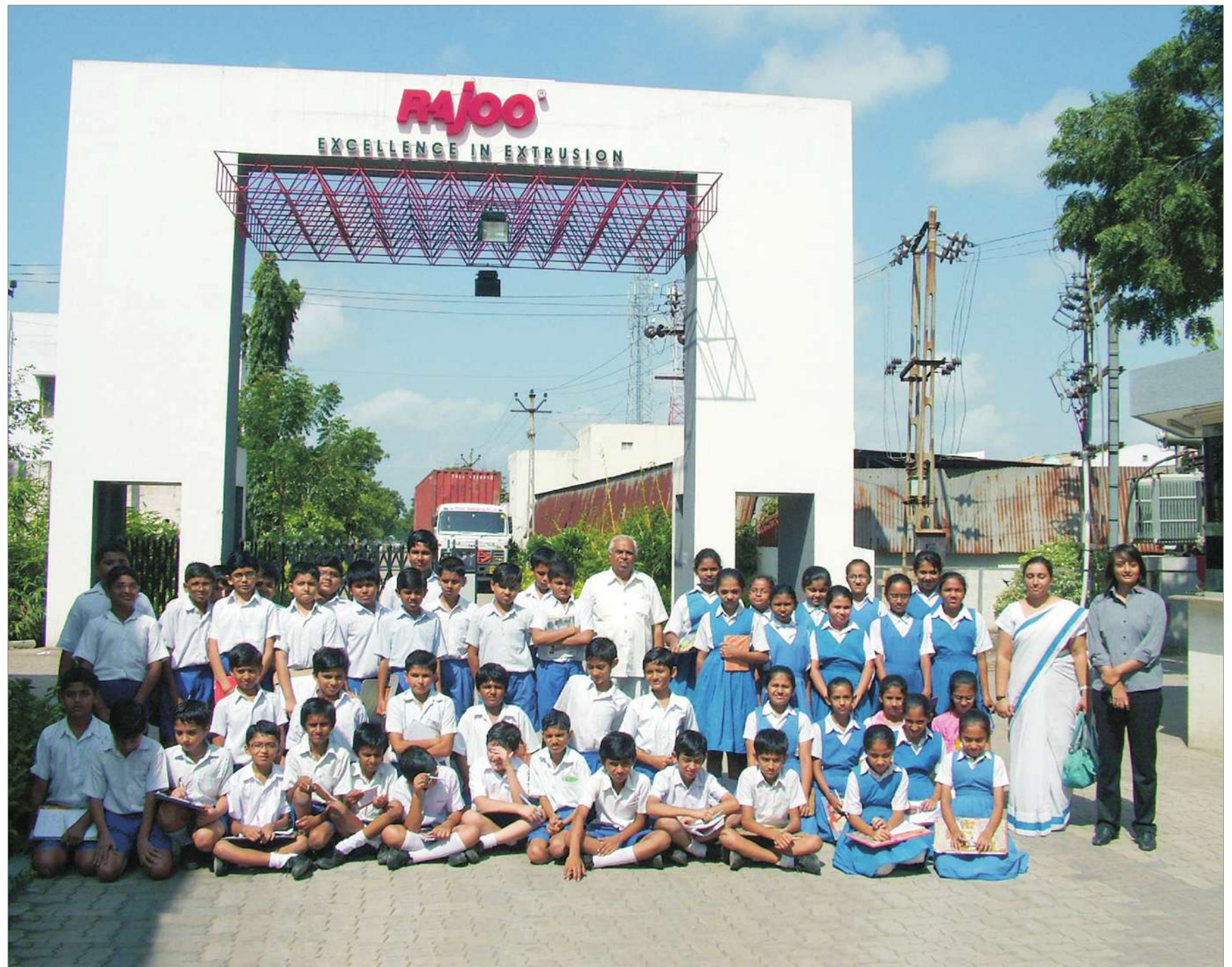
Visit of Primary School Students